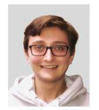
Pablo Martinez International Academy

am all of these things through the teachings of my parents and my upbringing in these virtues and qualities surrounding my everyday life."